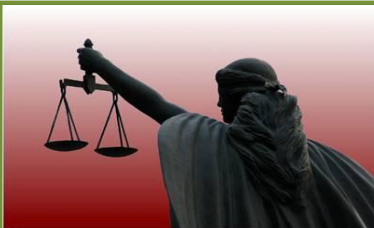
Fairness matters all